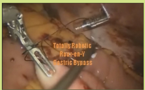
Robotic Bypass at AIIMS