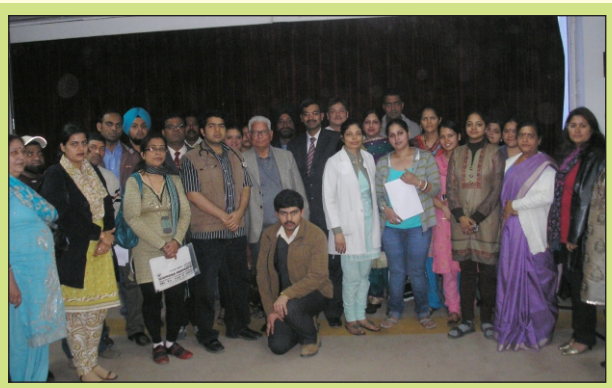
Second Support Group Meeting